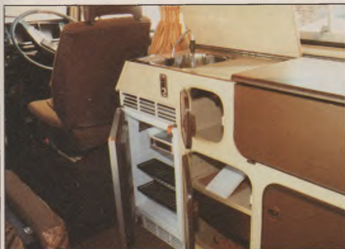
The Moonraker interior equipment and trim has worn surprisingly well and features fridge, cooker and sink.